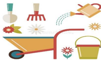
Horticulture and Forestry