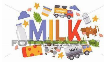
Dairy and Milk Production