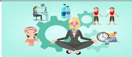
AYUSH & Wellness