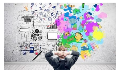
Research and Into-tech