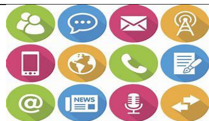
Electronic and Communication