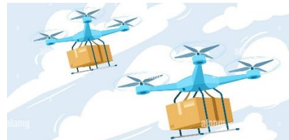
Logistics, Drone and Supply Chain