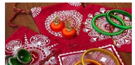
Handicrafts and Ethnic Textile