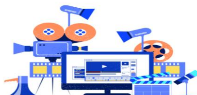
Film and Entertainment